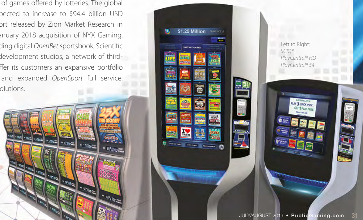
Left to Right: SCiQ ® PlayCentral ® HD PlayCentral ® 54

All ® notices signify marks registered in the United States. © 2019 Scientific Games Corporation. All Rights Reserved.